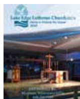
Photo Directories Available Now!

The Winsome Widows' Luncheon will be Wednesday, April 17; 11:45 am. All widows are invited to attend. Please sign up on the bulletin board. The Winsome Widows meet monthly on the third Wednesday at 11:45am at a variety of locations. Call the church office for location.