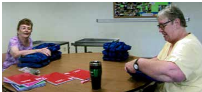
Packing School Kits Thanks to everyone who donated supplies, filled School Kit bags, and packed Kits for shipping!

Please make every effort to recycle all of these items. This is necessary. Discarded plastics are harmful to the environment. Thank you for recycling!