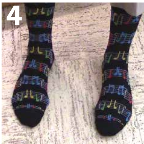
Jay's Socks Week 4: August 23, 2020