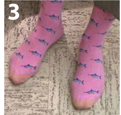
Jay's Socks Week 3: August 16, 2020