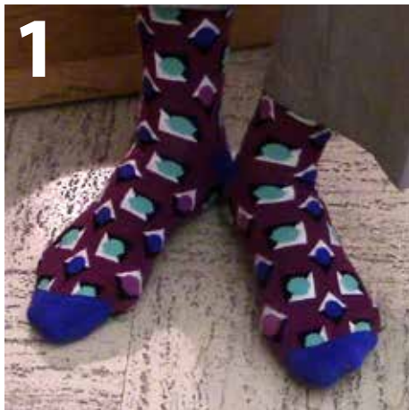
Jay's Socks Week 1: August 2, 2020