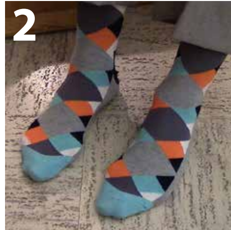
Jay's Socks Week 2: August 9, 2020