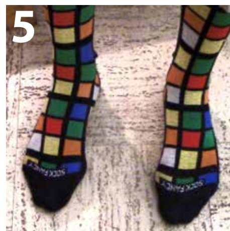
Jay's Socks Week 5: August 30, 2020